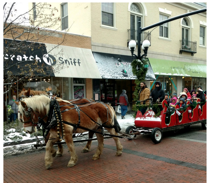
View article above for sleigh ride dates and times.

Santa's visit is courtesy of the Long Grove Park District. Registration is not required, and this event is free and open to the public. For more information, please call the Long Grove Park District at 847-438-4743 or email syoung@lgparks.org . The Long Grove Park District is a non-taxing public organization staffed by volunteers; any donations are appreciated. Please visit lgparks.org .