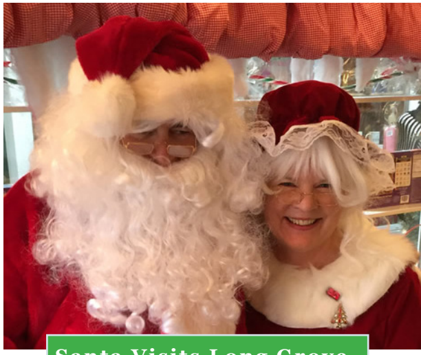
Santa Visits Long Grove

ather the wish lists and a camera and bring the family to Reed-Turner Woodland Preserve, 3849 Old McHenry Road, on Sunday, December 10, 2017. Santa will be there from 1:00 p.m. to 3:00 p.m. to visit with families, take pictures and hear of Christmas present wish lists. There will be refreshments and crafts for the kids, and there is no charge to see Santa. Residents are asked to bring an unwrapped gift to put under the tree for distribution to less fortunate children. No registration is needed. Questions? Call the Reed-Turner Woodland Preserve at 847-438-4743.