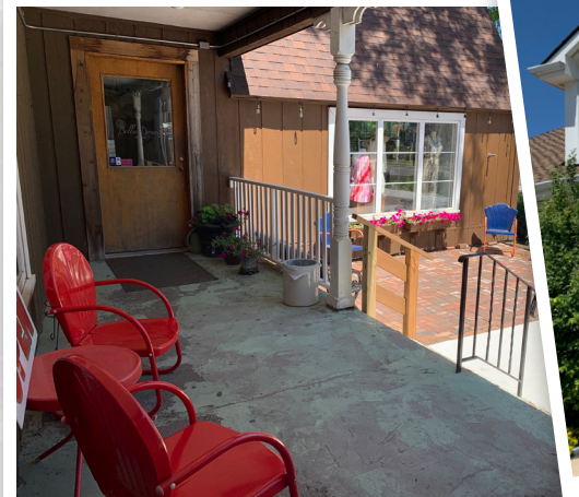
Ma and Pa's Candy