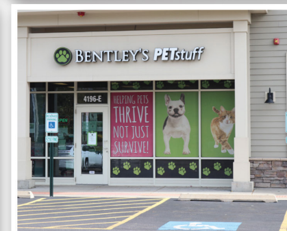
Bentley's Pet Stuff