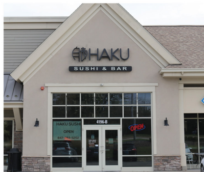
HAKU Sushi & Bar