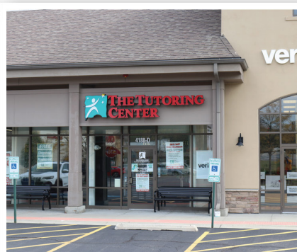
The Tutoring Center