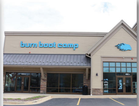
Burn Boot Camp