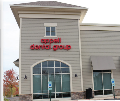
Appell Dental Group