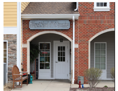
Midwest School of Pet Grooming