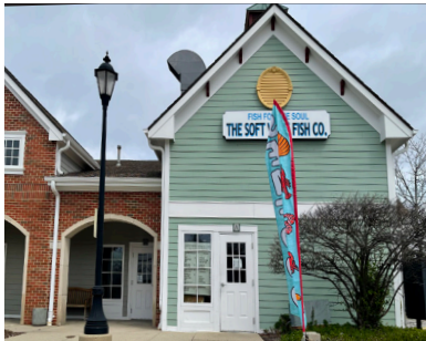
Soft Wave Fish Company

Long Grove has five commercial districts that are home to a wide variety of unique businesses, all of which have appreciated the ongoing support from residents, visitors and surrounding communities through the challenges of the pandemic. For a complete listing of Long Grove's unique shops, restaurants and other establishments, visit the Village's website at longgroveil.gov/businessdirectory .