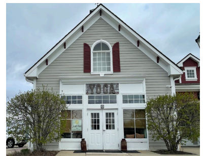
Just Bee Yoga