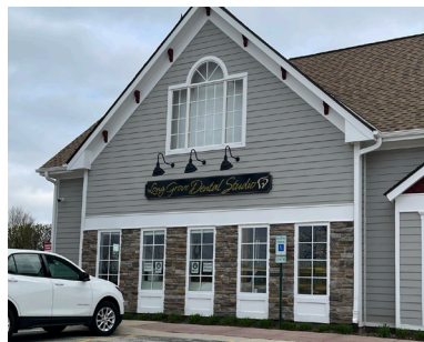
Long Grove Dental Studio