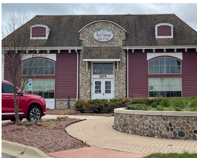
Red Cottage Salon & SPA INC