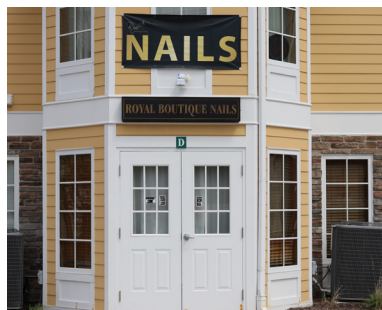
Royal Boutique Nails