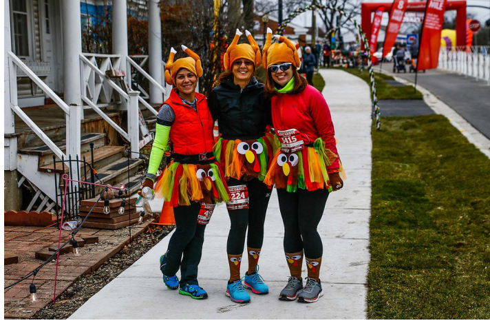
Turkey Trot photos from 2019 and course map courtesy of allcommunityevents.com