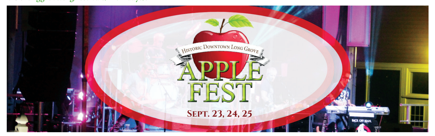
Apple Fest: September 23-25 The festival that is known to bring 'bushels of fun' to the Village will showcase hundreds of delicious apple-inspired treats for apple lovers of all generations. Other features include a vendor village, party bands, and timeless interactive games. Visit longgrove.org/festivals/apple-fest/.

Irish Days: September 3-5 All eyes will be smiling at Irish Days, the annual family-friendly celebration of Irish culture, music, food and beer. The cobblestone streets will be painted a fresh shade of green, and bagpipers, folk bands and Irish dancers will perform non-stop throughout downtown. In addition to authentic Irish food, drink and entertainment, highlights include the Irish Dog Beauty Contest and the Best-Looking Men's Legs in a Kilt contest! A Gaelic tent promoting Irish cultural awareness and merchants selling Irish-themed foods and goods round out this one-of-a-kind Labor Day weekend experience! Visit longgrove.org/festivals/irish-days/.