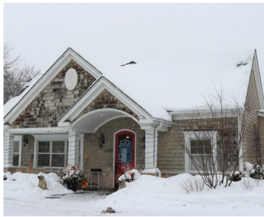
Skycrest Animal Clinic