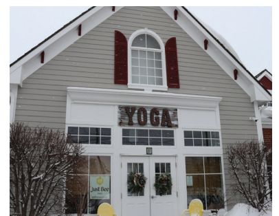
Just Bee Yoga