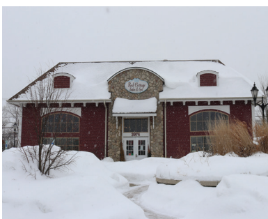
Red Cottage Salon & SPA INC