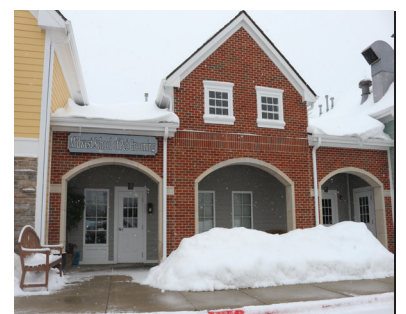
Midwest School of Pet Grooming