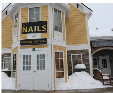
Royal Boutique Nails