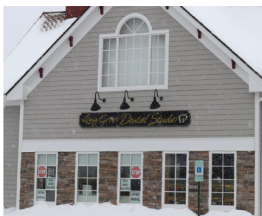
Long Grove Dance Studio