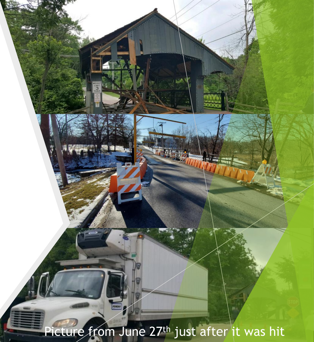
Picture from June 27 th just after it was hit